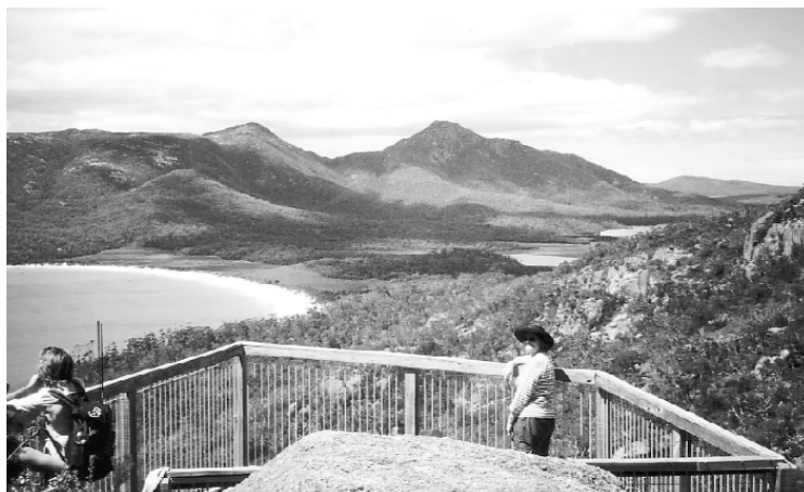
This has got absolutely nothing to do with Freycinet Vineyard but I thought I'd include a photo with me at the Wineglass Bay Lookout in Freycinet National Park that Lindsay and I climbed up to.

Pinot Noir: Freycinet philosophy on Pinot Noir production is to keep it simple thereby allowing the vineyard to express itself without extra winemaking