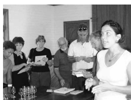
A very passionate Clos Henri's GM/ winemaker taking us through the tasting