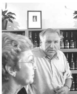
The owner at Neudorf – a winery with all the family involved.