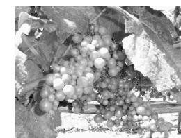
"Chicken and Eggs" at Palliser?