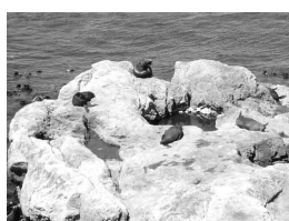
Part of a fur seal colony on the way to Kaikoura Winery