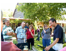
A very pleasant gardens location for the tasting at Neudorf