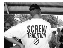
Lawson's Dry Hills winemaker. Like all in NZ, Lawsons made the early move to Stelvin screw caps