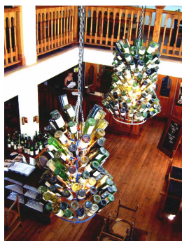
Chandeliers made from bottles above the dining room at Pegasus Bay winery