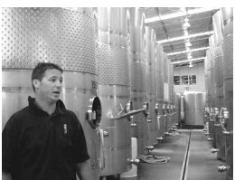
Withers Springs senior winemaker proudly talking about his hot/cold tanks; and other innovations in the winery – big bucks being spent!