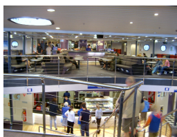
The 2-level centre of the Catamaran from North to South Island. The seating lounges were off to the side!