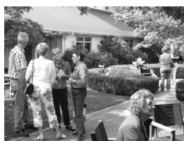
Group outside Palliser after tasting