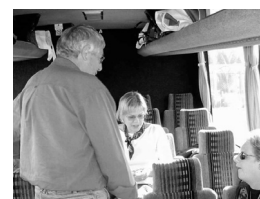
Organising the next stop!