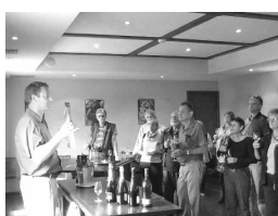
Tasting at Montana

Note to Grapevine Contributors Closing date for your contribution to the next Grapevine is close-of-business Wednesday 11th May, 3 working days after the 6th May Club Night