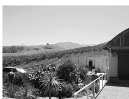
Cellar under the vineyard at Kaikoura Winery